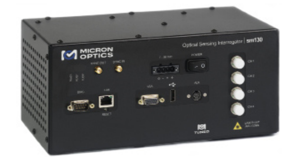
sm130 Field Module

The Micron Optics "sm - Sensing Module" platform responds directly to the user commands of the optical interrogator core and outputs sensor wavelength data via Ethernet port and custom protocol. All module settings, sensor calculations, data visualization, storage, and alarming tasks are run on external pc or sensor processor module. The Sensing Module platform is ideal for custom, client developed system management tools, but is equally compatible with local or remote installations of Micron Optics ENLIGHT.