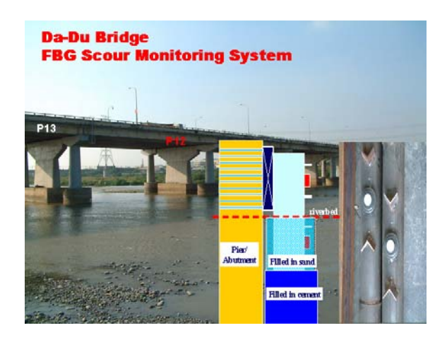
Figure 1 Installation of the FBG monitoring system in the Dadu Bridge

In the present study, it is shown that the FBG systems have demonstrated the capability to measure the water level, scour depth and deposition height. The field results indicate that the real-time monitoring system using FBG sensors has the potential for real world applications. However, to protect it from being damaged by the huge impact forces of the high-velocity flood with drifting debris and sediments, the installation procedures as well as the packaging of the FBG scour monitoring system require careful designs for more practical engineering purposes.