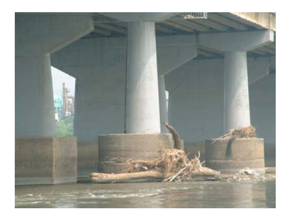
Figure 4 Debris trapped in front of the bridge piers