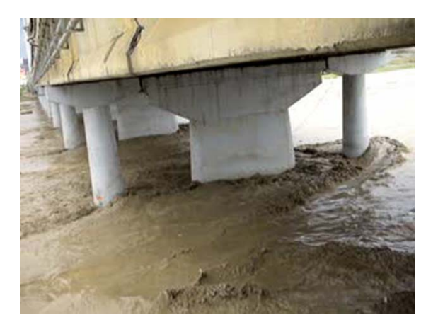
Figure 2 Water condition in the Aery flood